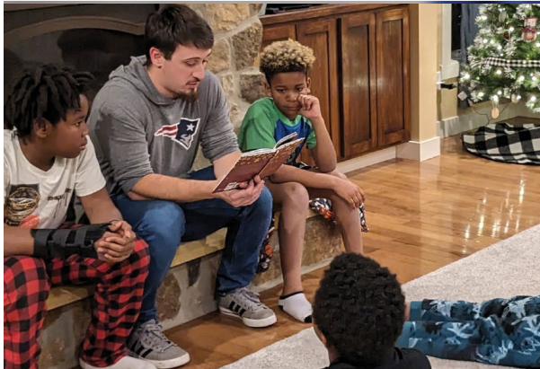
160 HOURS of biblical discipleship with adult staff members.